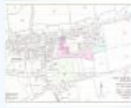
East St Farm