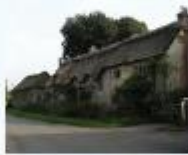
Oak Tree House